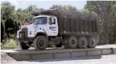
Portable Vehicle Weighing